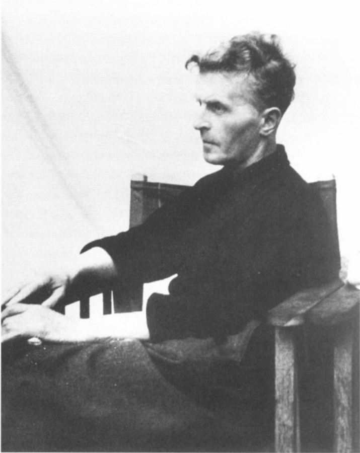
5. One of the last photographs of Wittgenstein, in the garden at the von Wrights' home in Cambridge with a bedsheet draped behind him for a background.